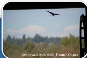
barn swallow & old fields - Hannah Coates

"Finally – a comprehensive organic gardening course for urban garden enthusiasts!"