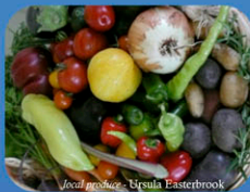
local produce - Ursula Esterbrook